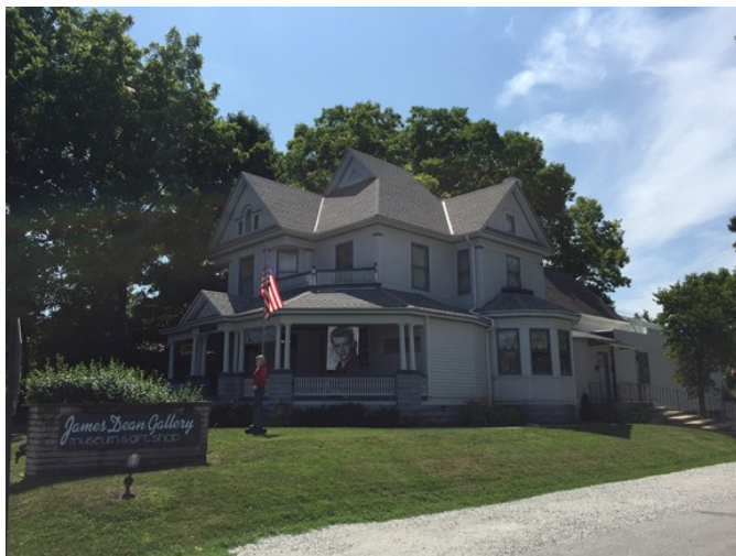
The James Dean Museum in Fairmont, Indiana

Brigitta and I had gone up to Fairmount two weekends before the event to check out both museums and figure out the very short route instructions (5 miles total!).