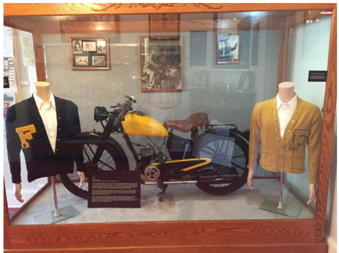
Dean's 1947 CZ Motorcycle

His parents kept all of Jimmy's memorabilia from his childhood, including his yellow 1947 125 cc CZ Czech 2-stroke motorcycle that he drove around in high school.