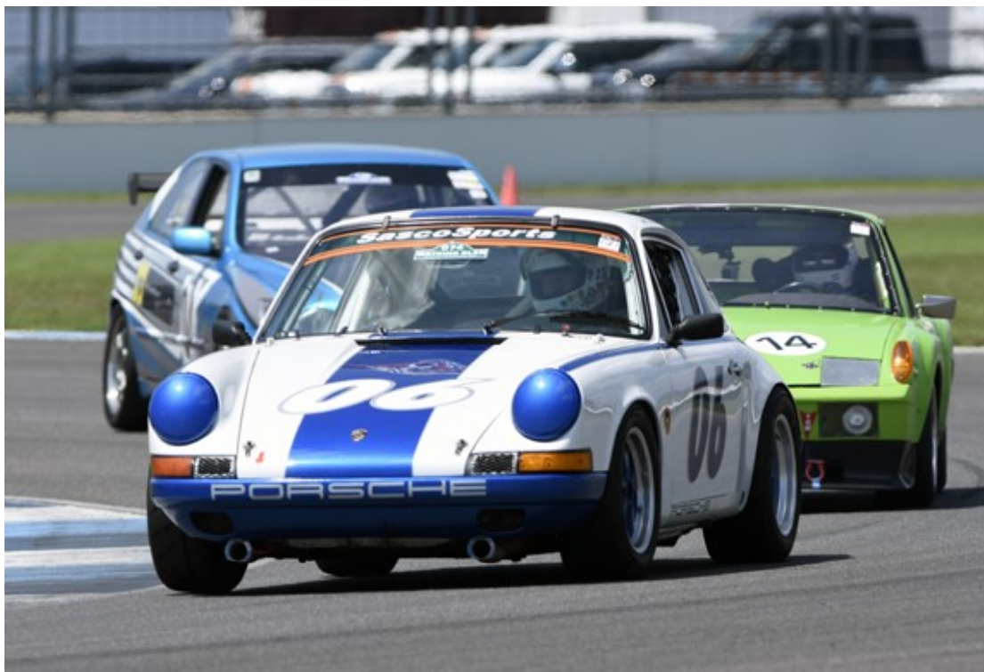
Skott Burkland in his 1969 Porsche 911 holds off John Perry's 914/6 through turn 8. Burkland finished 16th in Feature Race 1 for Group 8 and 12b cars and 14th in Feature 2.