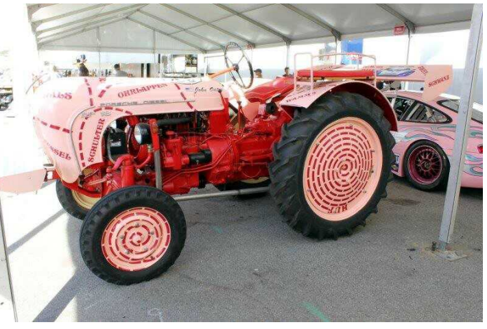
A future Porsche owner!