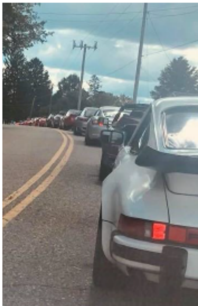
Photo 4 Eastern Buckeye Poker Run