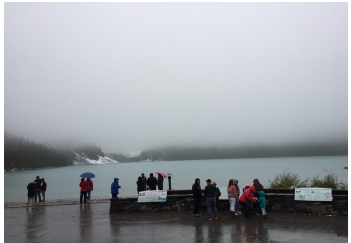
Come for the scenic views, stay for weather!

Snow is not unusual for Banff in June or September, but the long cold snap we encountered in mid-September was very unusual. Surprisingly, most attendees to the Banff Treffen drove their Porsche's from all over the country (both coasts and the Deep South) even though snow was predicted and highs were only in the high 40's and lows in the mid 30's (Fahrenheit). We saw only a few rental cars on the Driving Tours. Banff and Jasper National Parks straddle the eastern slope of the Continental Divide which separates Alberta and British Columbia.