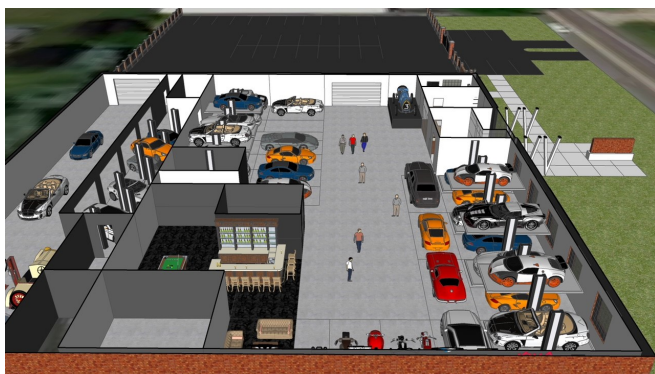
Artist's rendering of the interior of Pete's Classic Restoration & Storage

Pete's Service Center, located at 4902 North Pennsylvania, will continue to specialize in European and Classic automotive repair.