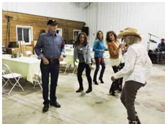
Country & Western Dancing