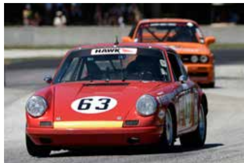
George Calfo #63 1965 Porsche 911