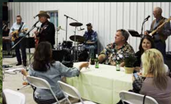
C & W Band Bakersfield Bound