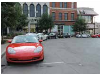
Shelbyville 18 on the Square September, 2015