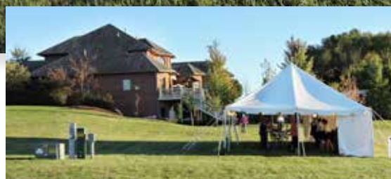
Shuck's House & Food Tent