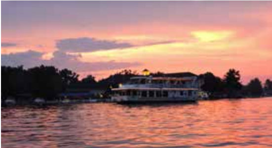
Oakwood Resort & Porsches to Winona Lake July, 2015