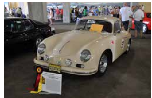
Concours 1957 356 coup