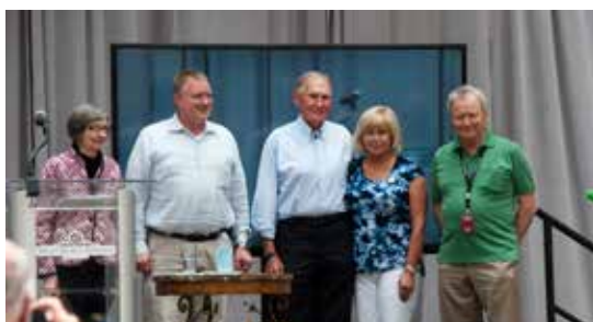
Domes of the World seminar