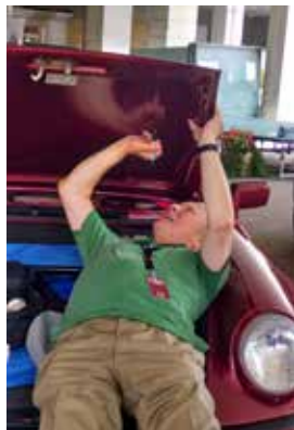
Dr. Wolfgang Porsche signing the 'rose' 1989 930 belonging to Steve McCombs of Bluegrass Region. The car is not only special as it is an homage to his late wife but the color is so special that there are only two 930s of this tonality in existence in the world today.