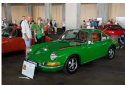
Concorso Green Bean