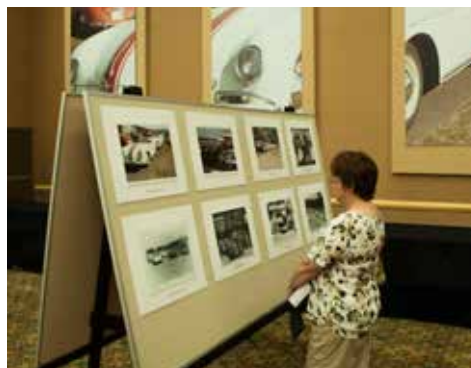
PCA Museum photos on display