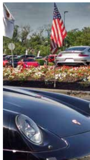
US debut of the Cayman GT4 at the PCA Tech Academy