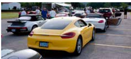
Ohio River by way tour