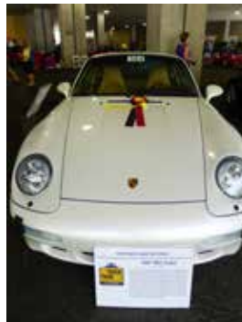
Pearlescent paint to sample