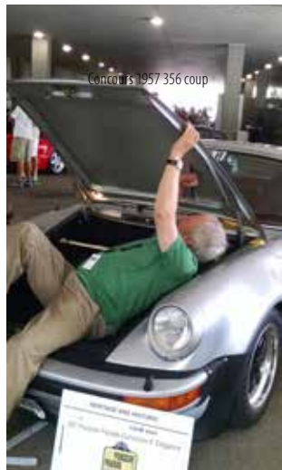
Concours 1957 356 coup