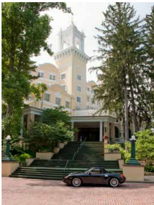
The stairs at West Baden with S10