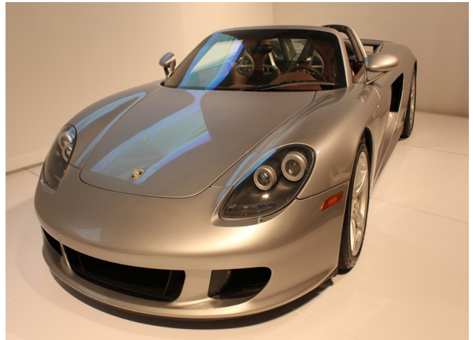
2005 Type 980 Carrera GT