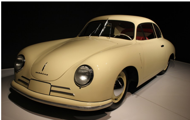
1949 Type 356 Gmund Coupe

Yes, but why Raleigh? Never mind, we had hours to travel and mountains to cross. We rolled on, nearly polished all the snacks we'd taken along, and, finally arrived at the Hampton Inn we'd booked in Cary. The in-room brochures on the area, as enticing as they might have in different circumstances, didn't get a rise out of us. We were just too dog-tired. We managed to drag ourselves to the O'Charley's within a stone's throw of the room, eat a quick dinner, then collapse.