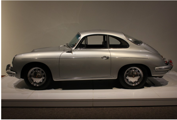
1964 Type 356C Carrera 2 Coupe

of kinetic art – an industrial design that's styled and purpose-built."