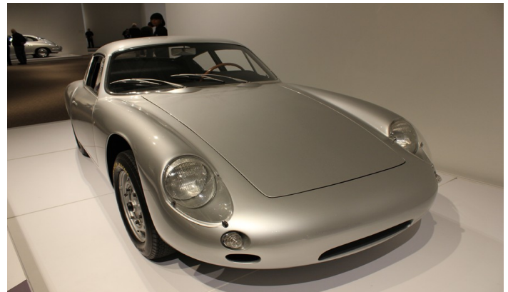
1961 Type 356B 1600 Carrera GTL Albarth

Inspiration for the exhibition came about