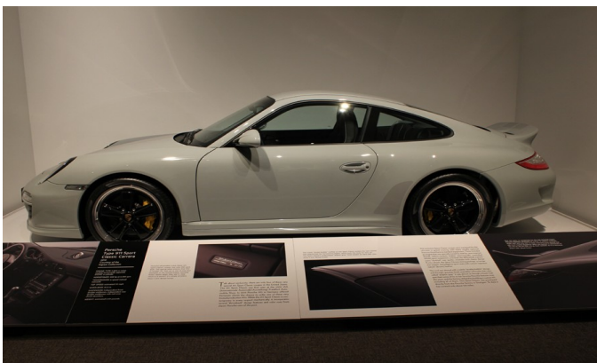
2010 Type 911 Sport Classic Carrera

To learn more about the Ingram family collection, see The Financialist article at: http://www.thefinancialist.com/porsche-911-marks-a-half-century/