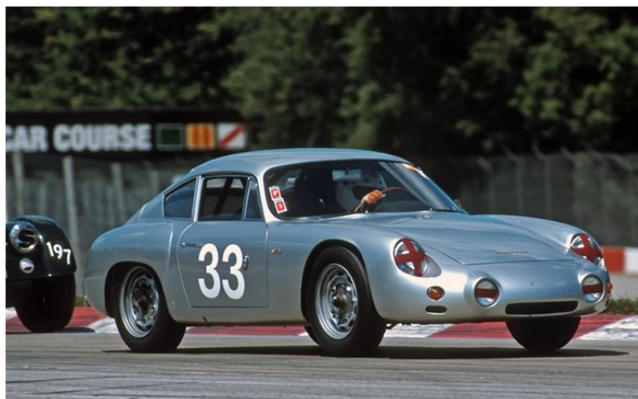
1960 Porsche Abarth Carrera GTL

Read more at http://www.supercars.net/cars/1510.html#y5U2BUfuvLvD1K26.99