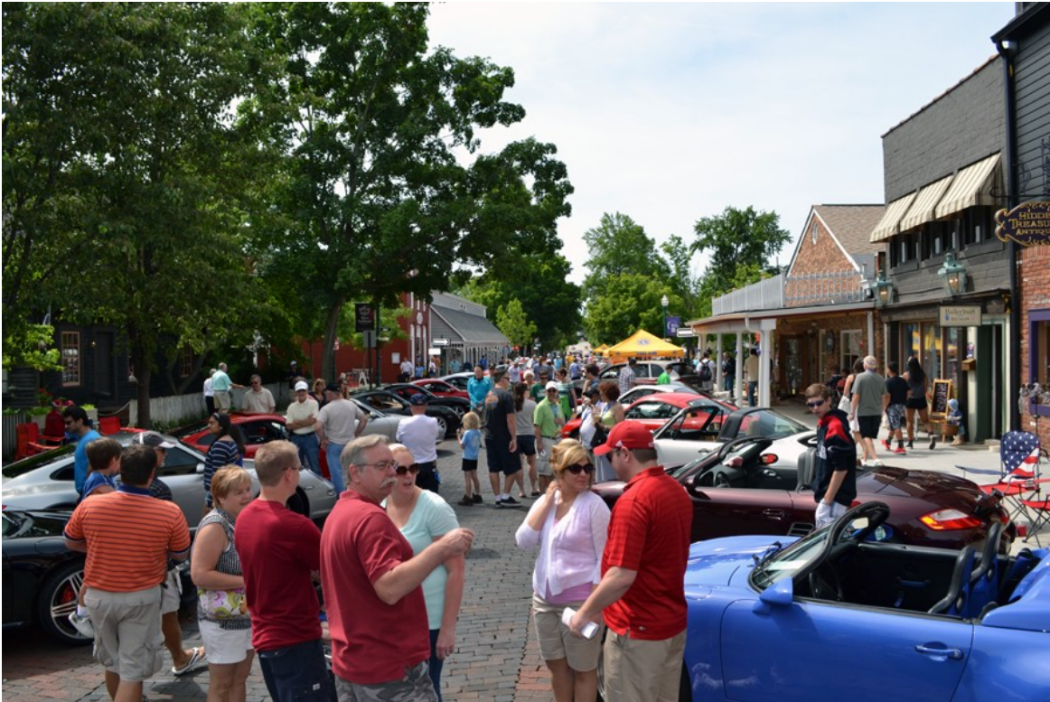
The 2014 edition of CruZionsville attracted a huge crowd of participants and spectators!