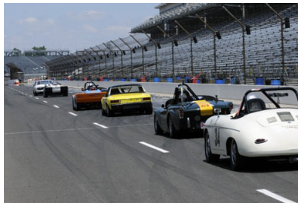
Group 3.4 cars set off for qualifying through the pits. The Porsche 356 of George C. Balbach is in the foreground.