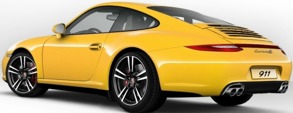
2012 PORSCHE 911 CARRERA