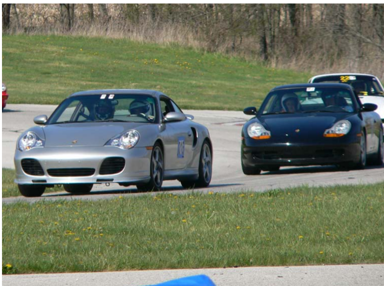
WE ARE BACK AGAIN, BIGGER AND BETTER THAN EVER, THE LAST CIRPCA DRIVE OF THE YEAR.

On Sunday from 1:30 -2:00 we will have a Taste of the Track for visitors. This is a chance for you to ride with a Porsche Instructor around Putnam Park's race track at moderate speeds. This is for non driver education people only and there is no cost; however we will be soliciting donations. Folding money only! http://cir.pca.org/Calendar.aspx