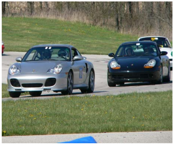
WE ARE BACK AGAIN, BIGGER AND BETTER THAN EVER, THE LAST CIRPCA DRIVE OF THE YEAR.

On Sunday from 1:30 -2:00 we will have a Taste of the Track for visitors. This is a chance for you to ride with a Porsche Instructor around Putnam Park's race track at moderate speeds. This is for non driver education people only and there is no cost; however we will be soliciting donations. Folding money only! http://cir.pca.org/Calendar.aspx