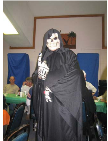
PUMPKIN RUN DE and HALLOWEEN PARTY!

Beautiful fall weather has been ordered, instructors are changing tires and adding oil, students are washing and waxing their cars and we understand that the 7' Frankenstein and Bride will return for the Halloween Party. Yes, you read correctly, we are having a Halloween buffet dinner and costume party at the American Legion in Plainfield after the track closes on Saturday night. The dinner and party is for all CIRPCA members and their guests. DE students and instructors eat free because the cost was included in their registration fee; all others pay a modest $20.00 per person charge. There will be adult beverages at your expense. Again, this is a costume party, so dress up in your favorite drag outfit and join us.