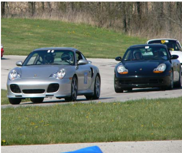
WE ARE BACK AGAIN, BIGGER AND BETTER THAN EVER, THE LAST CIRPCA DRIVE OF THE YEAR.

If you have wondered what Driver Education is all about come out to Putnam Park anytime between 8:00 am and 5:00 pm Friday, Saturday or Sunday and visit us. Walk around the paddock, look at the cars, have lunch with us, talk to your friends, meet other students and instructors. It's free!