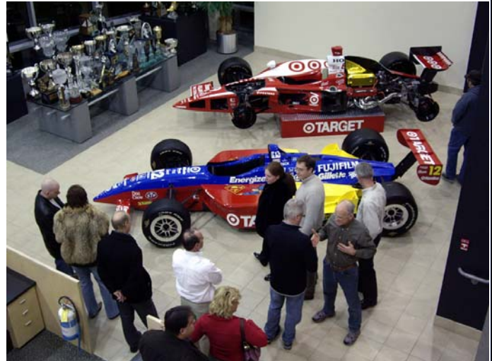
The lobby of Target Ganassi Racing.