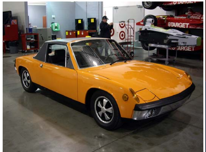
Chip Ganassi's fully restored 914.