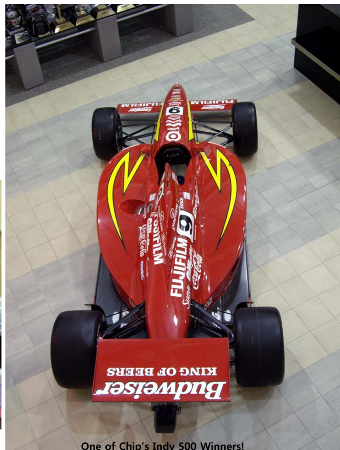
One of Chip's Indy 500 Winners!