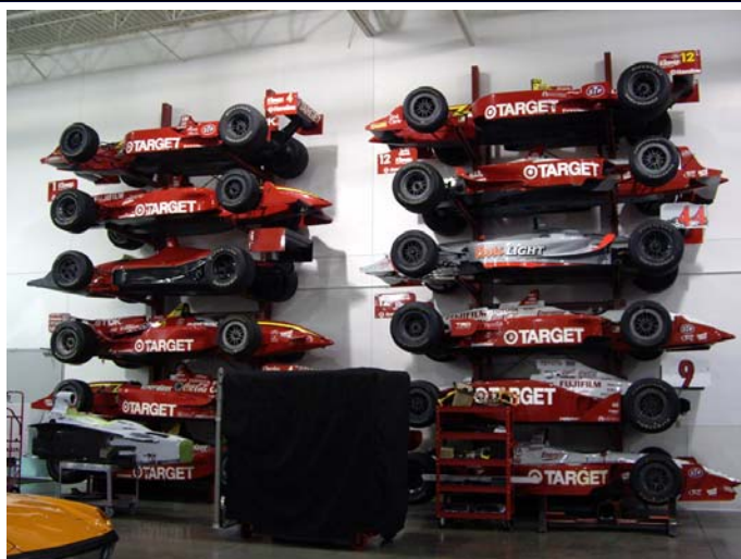
18 Vintage CART and IRL chassis line the walls of the truck bay. Need a better ride for Pole Day at Putnam Park? Make Chip an offer!