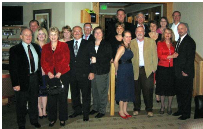
At the 2010 Valentine's Day Extravaganza

So grab your main squeeze and get ready for an evening of fine dining, dancing and fun.