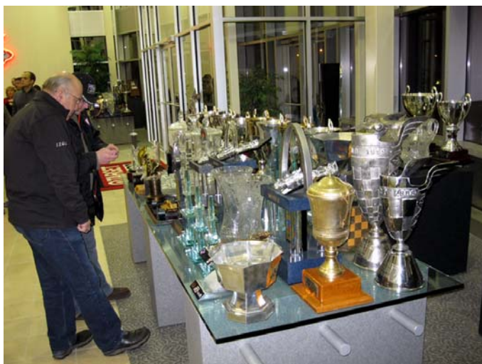
Here are just a fraction of the winner's trophies on display at Target Ganassi Racing.