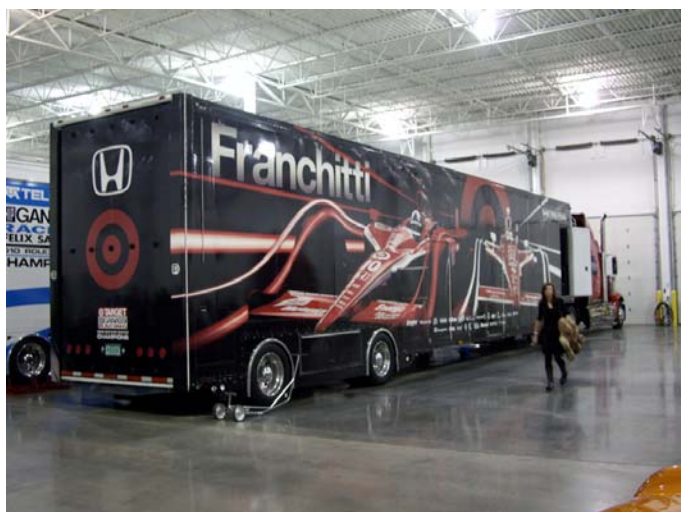
Dario's truck is loaded and ready to leave for Sebring testing in the morning.