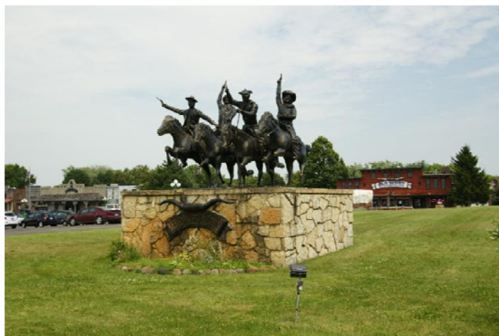
Wild West Town near Union Illinois, with the Old West Steakhouse