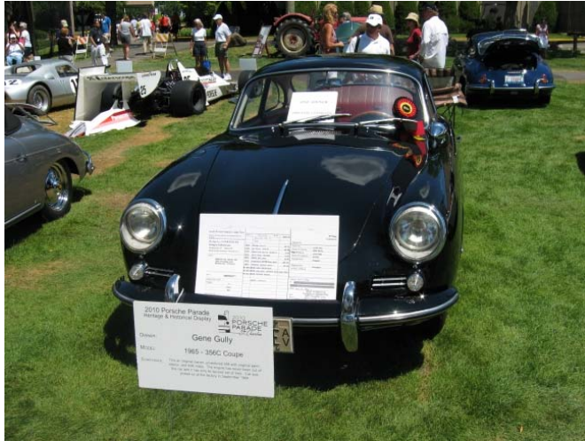
1965 356C Coupe - This is an original owner, unrestored 356 with original paint, interior and 45K miles. The engine has never been out of the car and it has only its second set of tires. Car was picked up at the factory in 1964.