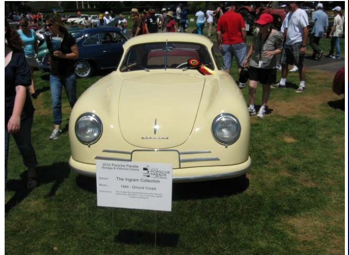
1949 Gmund Coupe - One of about 50 of the first Porsches built in Gmund, Austria soon after WW II.