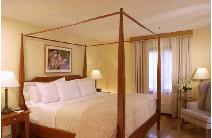
New Harmony Inn Premium Room