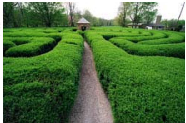
The Harmonist Labyrinth

Much has been preserved, including early Harmonist log cabins, cemeteries and garden mazes along with two hundred year-old masonry buildings – some are the oldest buildings in Indiana.