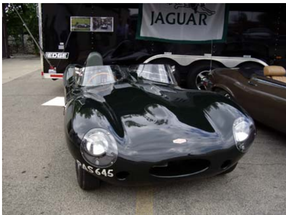
Rare D-Type Jaguar Le Mans Race Car

House in conjunction with the National Jaguar Club Meeting in Indianapolis. Muncie Imports and Classics is one of the top Jaguar restoration facilities in the country and is widely known for their leather restoration work. Numerous cars were on display in 3 buildings, some in the process of restoration and other fine examples of their finished pristine craftsmanship.