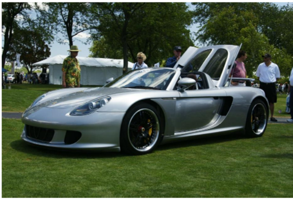
Carrera GT in the Concours Corral

One of my personal favorites in the concours corral was a Carrera GT that a PCA member brought from Oklahoma. It was an outstanding automobile in immaculate condition. He probably would have done well in the formal concours.