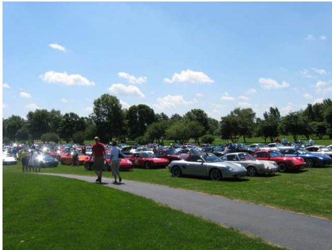
There were hundreds of Porsches in the "Porsche Corral"