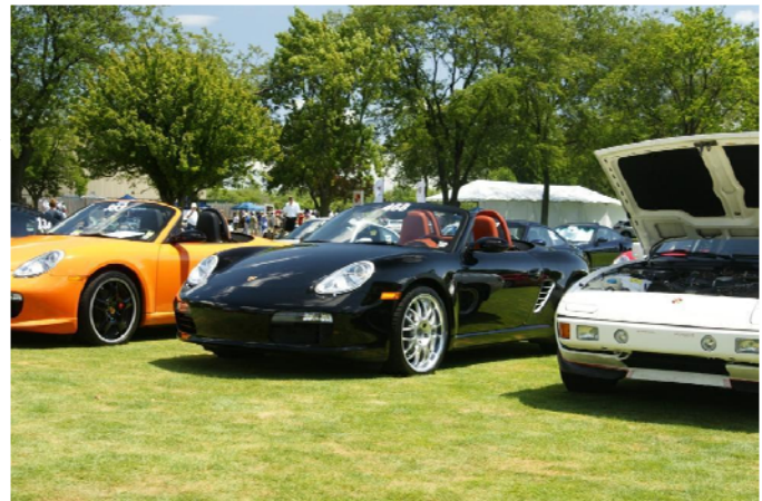
Merritt Webb's Black 2006 Boxster in the Concours Corral

The Porsche Concours d' Elegance was Sunday, and was held on the golf course. There was also a concours corral where your individual car could be displayed. There were some outstanding cars both in the corral area as well as in the formal concours.