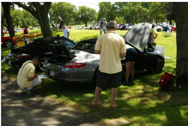
Judges reviewing a 911 in the formal concours

I had put the 19 inch rims on my Boxster just in time for the Parade. I had been waiting for my Michelin Pilot Sports to wear down so I could put the larger rims and new tires on. I