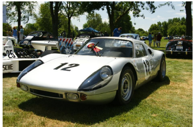
Porsche 904 at the Concours