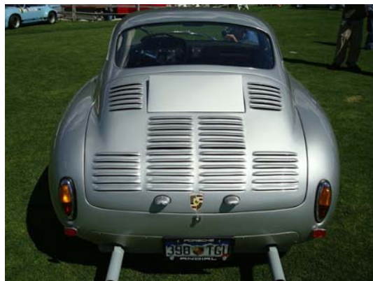
Abarth Carrera rear view

Each day we managed to feed ourselves lunch by making sandwiches from some goodies purchased at a local store, with no girls around that meant white bread with mayo and turkey, and an occasional beef jerky stick with a side of cheese ball and a Dr. Pepper to wash it all down. I wasn't sure if we were having lunch or getting ready for a Super Bowl party! One day we decided after our gourmet guy lunch that a trip to the Continental Divide was in order, and although the rental car protested we made it to the top in only a half hour or so. We managed a short walk up some stairs to take in some beautiful scenery, but had to stand there for a minute to catch our breath at that altitude. It was amazing how quickly you became winded and had to pace yourself physically for just a few stairs. On the way back down we took another break and were getting our breath when we saw one of the riders on the US Cycling team come pedaling to the top. Pretty embarrassing...they were getting a final test in before the Tour de'France began, and we could barely make it back to the car.