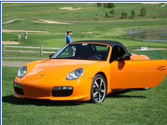
Orange Boxster Special Edition