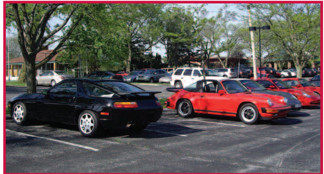
Some of the Porsches at Second Saturday Breakfast in Fort Wayne.