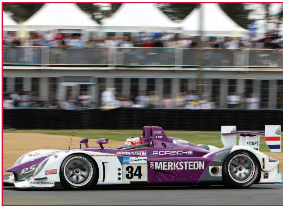
Checkered flag at Le Mans for Van Merksteijn Motorsport Porsche RS Spyder

"Right from the start I felt great in my guest team and I was surprised at the level of engagement and determination at which they worked," said the Porsche works driver.