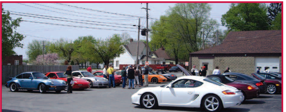
2008 Spring Color Tour started in Morristown

It all started in 1978 in Muncie when a group of us bachelors were hanging out at the old Cork n' Cleaver Restaurant in Muncie and kept running into each other in the parking lot with our sports cars. Several had Porsches and we noticed a few other customers of the restaurant also had Porsches, so we decided this was stupid and we ought to start a club to have fun with our cars. I was appointed to look into this, what was required to form a new club and if there was another club close by to us that we could join. There was a club in Indianapolis (Central Indiana Region), but it was deemed too far away to go to events and we felt we could drum up enough (25) local owners to start our own region and stage our own events. It took us a full year to scrounge up 25 new members and we only used 3 transfers from the existing CIR club and CIR was willing to cede many counties in eastern Indiana to us to form a new region, including Fort Wayne, Marion, Muncie and Richmond.