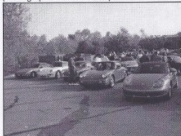
Our first stop was The Seasons Restaurant in Nashville