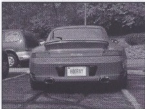
Hooray for the new turbo!