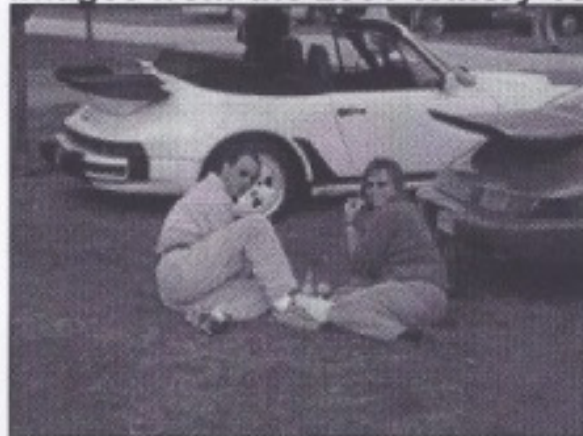
Picnics and Porsches: what a terrific combo!