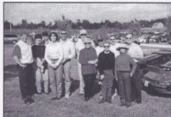
CIR's newest members enjoying their first Winery Tour