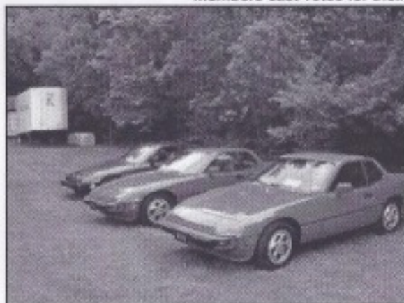
Which 924 will win its class?