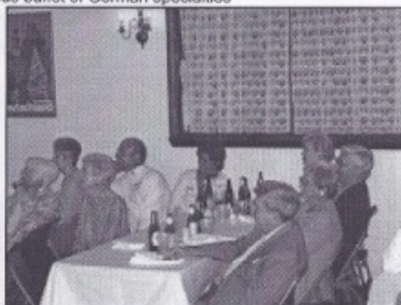
The evening honored Charter and other early CIR members