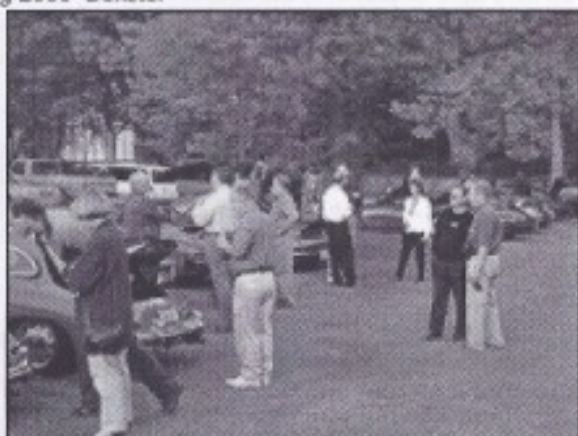
Members cast votes for their favorite Concours entrants