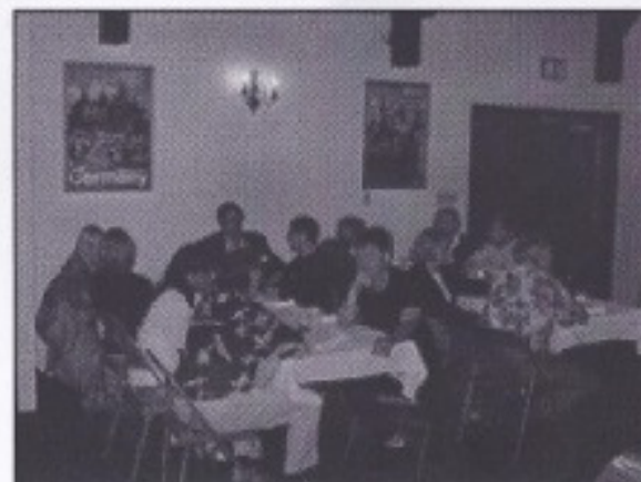
Members, new and old, swap stories and share memories during dinner