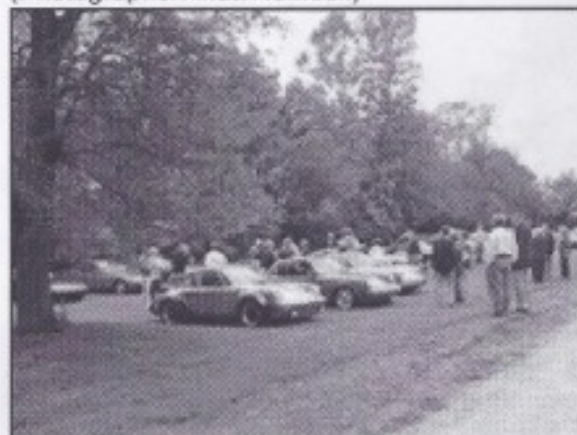
20 cars were displayed in the 40th Anniversary Concours