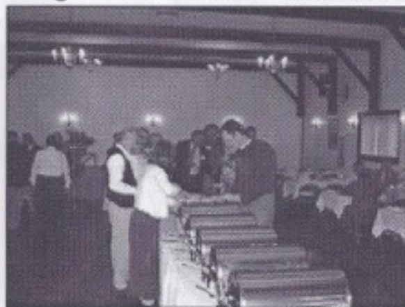
Guests feast on a sumptuous buffet of German specialties