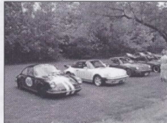
How can you pick just one?